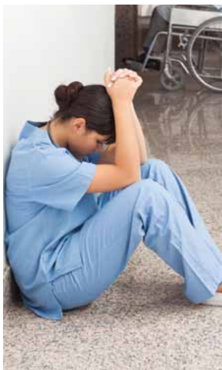
Bullying can affect nurses' ability to care

A number of steps can be taken to support a healthy workplace and thereby prevent bullying. The literature suggests several ways to tackle bullying within nursing including providing education, developing codes of acceptable conduct and introducing a zero tolerance policy (Broome and Williams-Evans, 2011). Leaders and managers must use