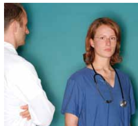
Staff may feel unable to defend themselves

5 Policies to deal with the possibility of bullying in the workplace and "zero tolerance" of this behaviour are needed